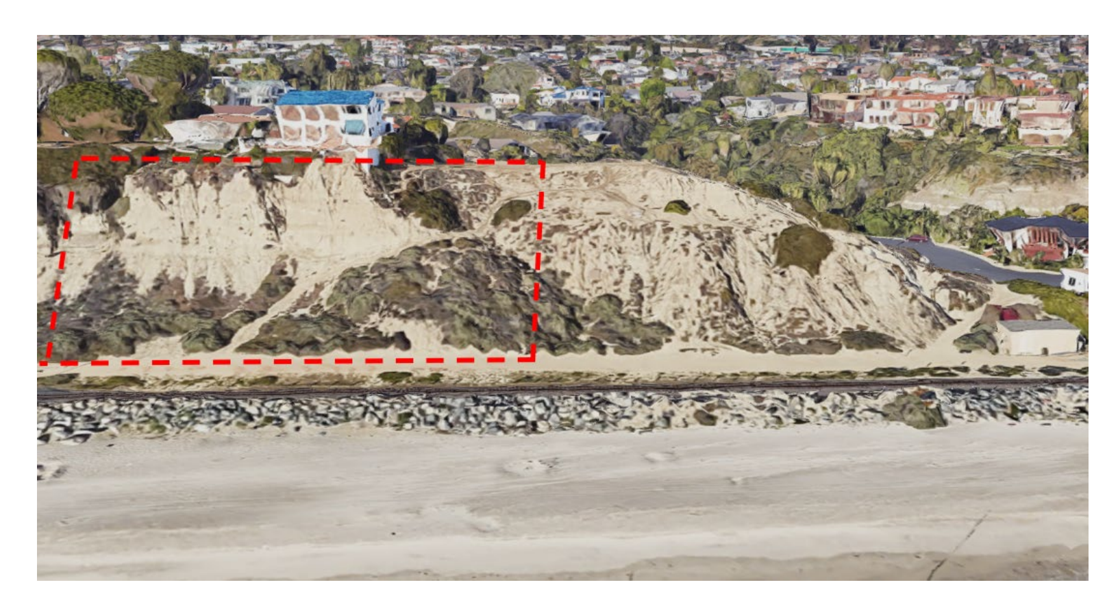
Exhibit 4: View of Study Area from Public Beach

Bluff Beach Trail Public Use Questionnaire September 2023 Page 7 of 7