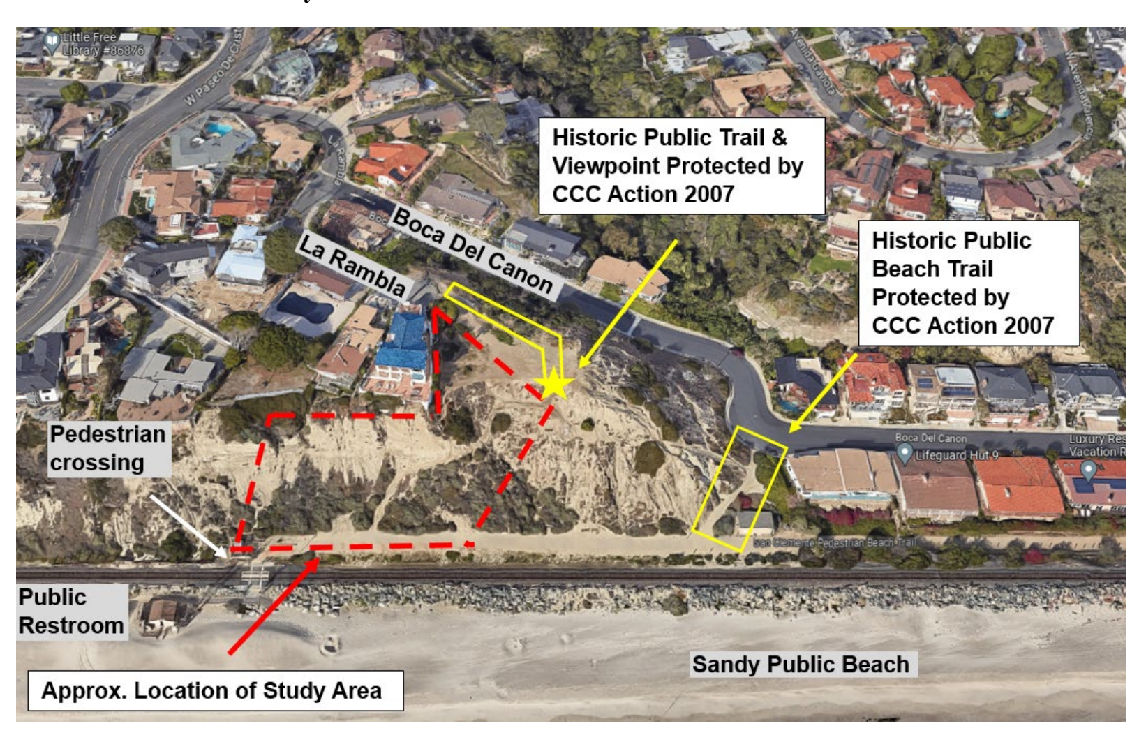
Exhibit 2: Study Area

Please note that the areas shown in yellow below were a part of a previous prescriptive rights study. These areas were determined to have historical public use rights and are protected for public use by a California Coastal Commission (CCC) action in 2007.